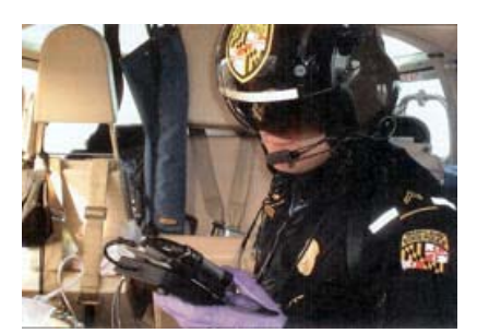
IP Connect Anywhere